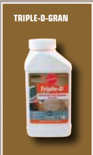
Aluminum Loss of Foaming Coil Cleaners vs. Triple-D™